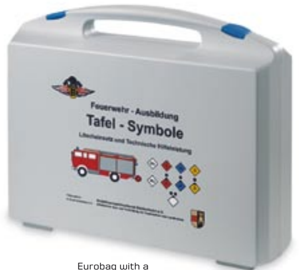
Eurobag with a multi-coloured, durable, long-lasting screen print.

○ not possible *to special order For technical reasons sizes may sometimes vary from those as printed.